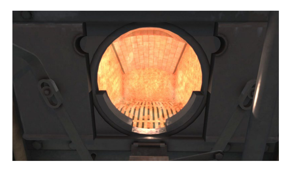
Coal level low < 42% 661 lb The grate can be seen with a small amount of coal.