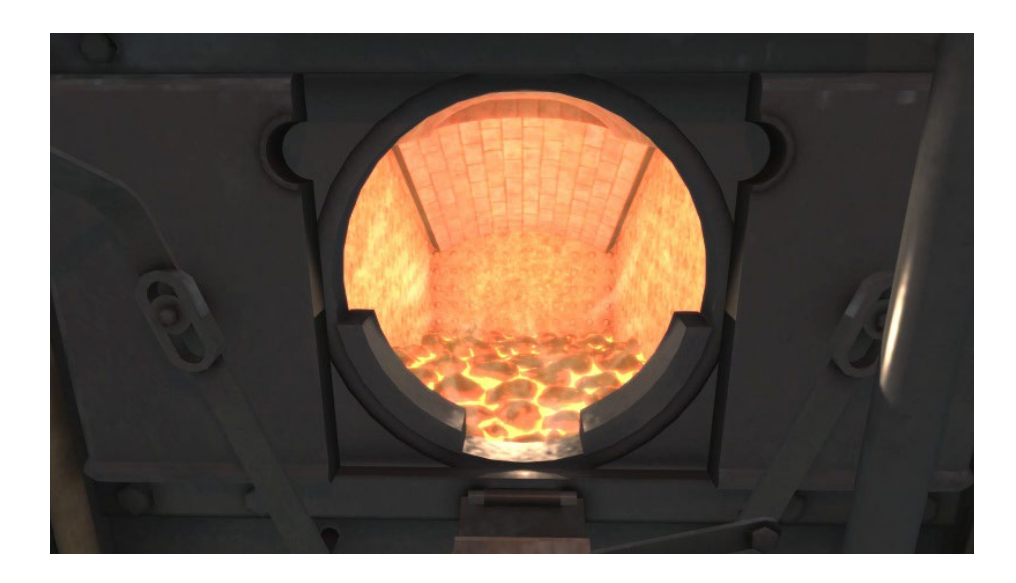
Coal level average 63% 992 lb